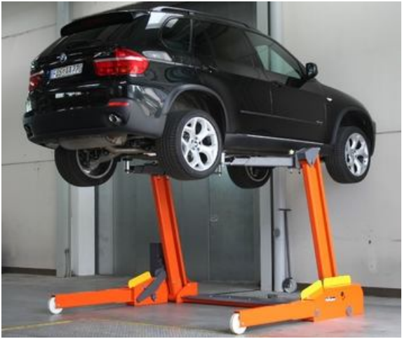
Mobile car lift also for SUV vehicles